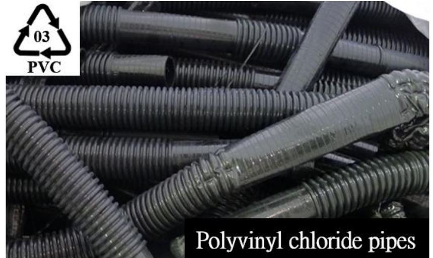
Polyvinyl chloride pipes