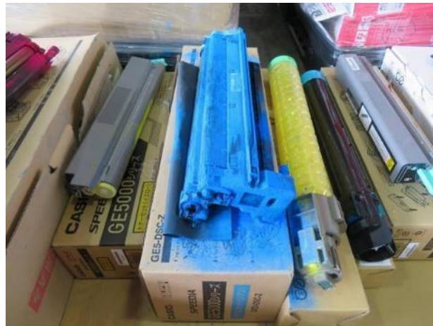
Waste toner cartridges