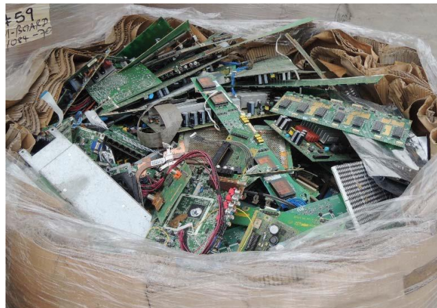
Waste printed circuit board assemblies