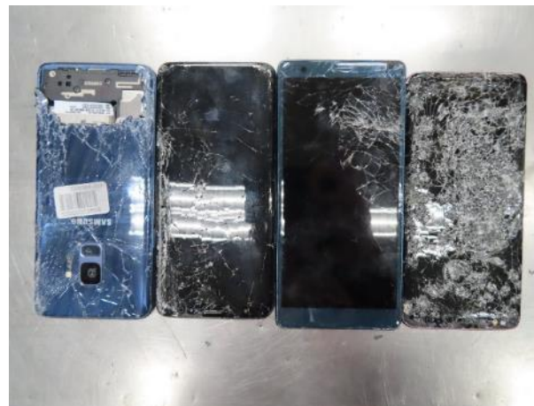
Waste mobile phone displays