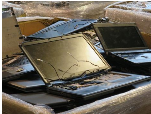
Waste laptop and desktop computers