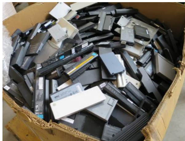
All types of waste batteries